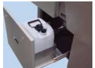
New, easily accessible water system.

Space requirement: 4 stations 2.6 x 1.2 m 6 stations 3.3 x 1.2 m