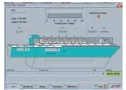
Improved Human-Machine Interface system.